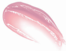
Sweet Butter Sheer pink