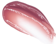
Rose Butter Light mauve