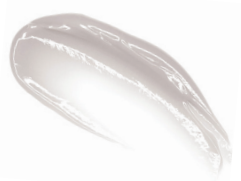
Pure Butter Clear