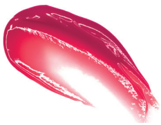
Strawberry Butter Poppy cherry

This silky lip mask hydrates lips with a wash of color to soothe and nourish dry lips instantly. Apply on the go for all day moisture and shine.