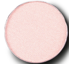
Pink Opal Light pink