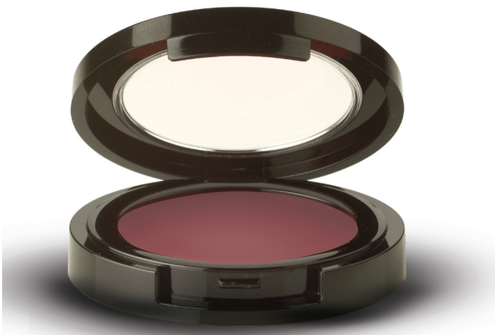
Cherry Berry Berry Red

A sheer, creamy 2-in-1 cheek and lip color. Awaken your face with a touch of color!