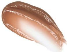
Honey Butter Light beige