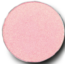
Sugar Rush Light baby pink