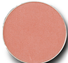
Muse Muted brown