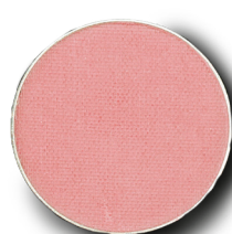
Siren Cool mauve pink