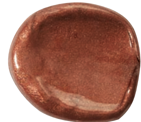
Famous a bronzed brown