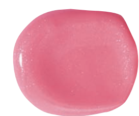
Slip a translucent pink