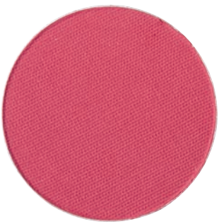
Cherry Bomb a deep cherry with coral undertone