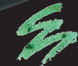
Limestone a bright yellow green with slight shimmer