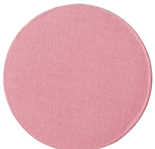
I Pink I Love You a blue pink