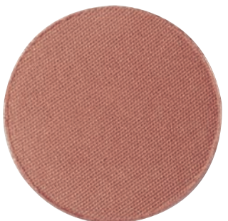
Sun Baked a toasted cranberry with gold shimmer