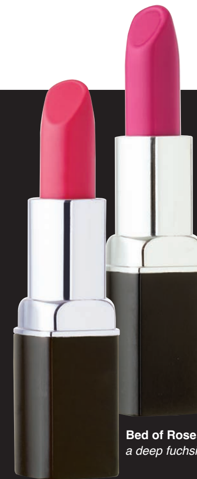
Smooches a pink coral

Smooth texture and a cream finish that won't feather or fade and has extreme staying power.