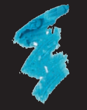
Skyline a sky blue matte