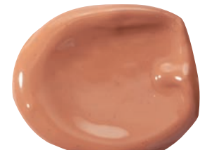
Yummy a flesh tone