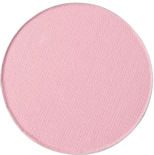
Virgo a light pastel pink