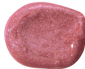
Lady Godiva a frosted bronze pink