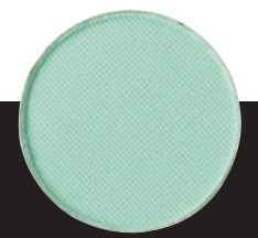
Happy a matte blue green