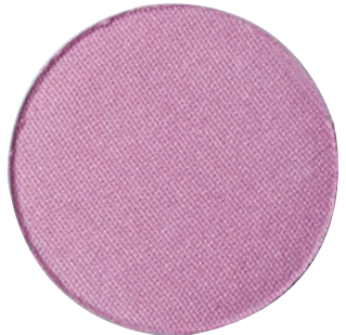
Zone a frosted magenta