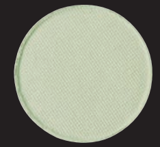
Zest a pastel shimmery green