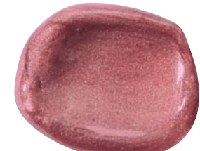
Tender a pale plum