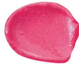
Juicebox a bright fuchsia