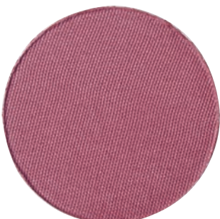
Satisfy a deep burgundy