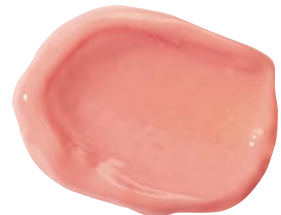
Sweet Tooth a sheer coral