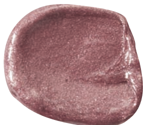
Expense a frosted mauve