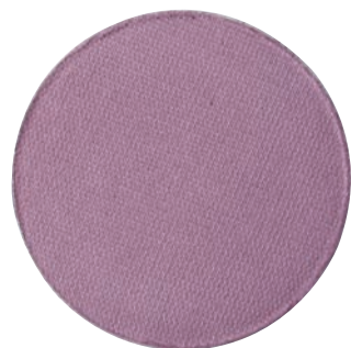
Artist a deep pastel purple