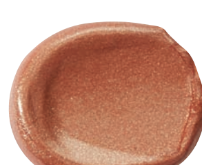
Cozy a pink bronze