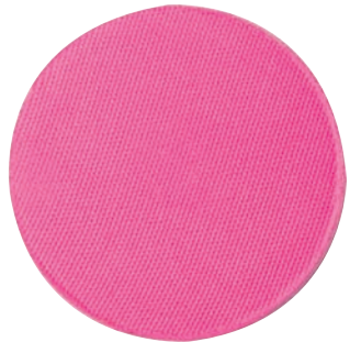
Swag a hot shimmery pink