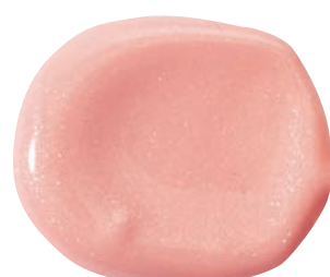
Adore a milky pink