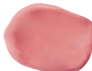
Scoop a rich pink