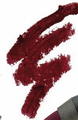
Winery a deep wine

This new plum is great for defining lips. The soft, creamy formula glides on effortlessly for intense, true color that won't feather, bleed, or fade.