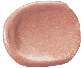
Bliss a nude coral