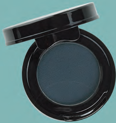
Covert a flat deep navy