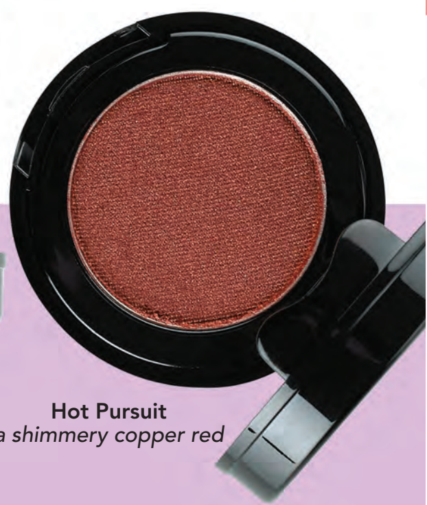
Hot Pursuit a shimmery copper red