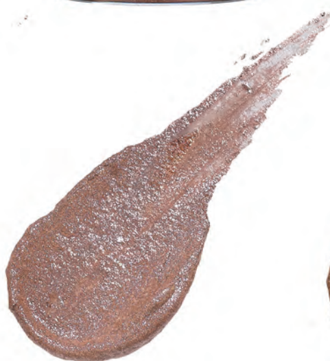
Milky Way a light brown with silver glitter