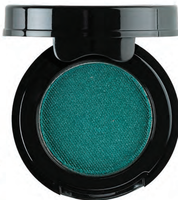
Under The Sea a jewel-toned turquoise