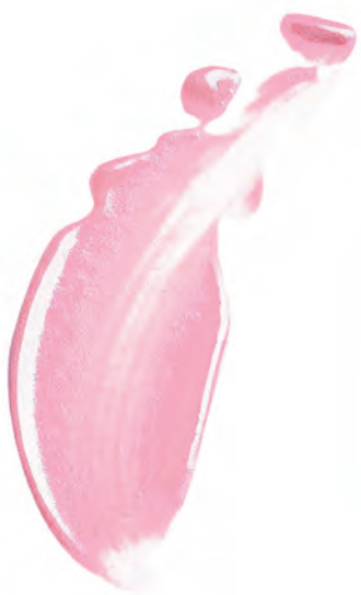
Pink Parfait a soft baby pink