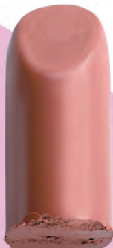
Quicksand (Matte) a sandy nude