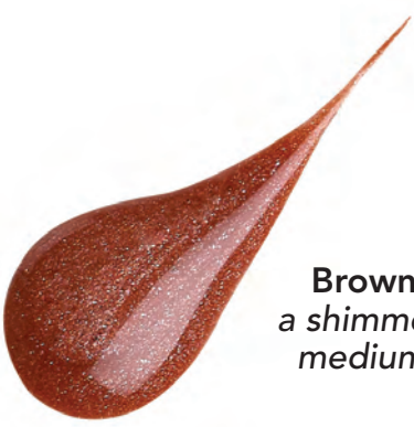
Brown Sugar a shimmery warm medium brown