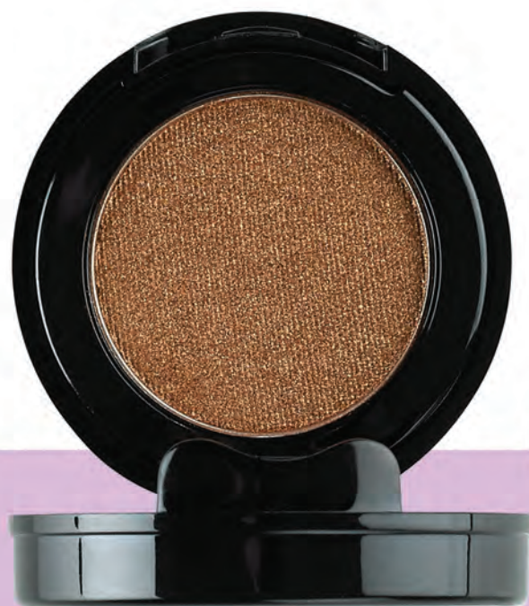
Golden Eye a foiled amber