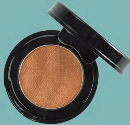
Heat a frosted copper