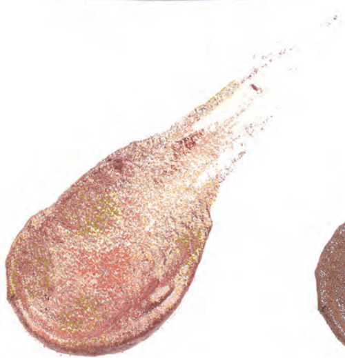
Supernova a shimmering rose gold with silver glitter