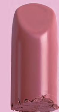
Amoré (Luxury Creme) a dusty rose