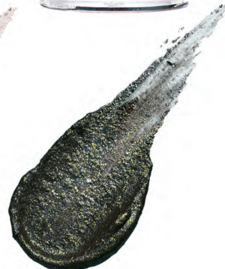
Zodiac a black with silver & gold glitter