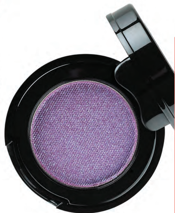
Unicorn an opalescent purple