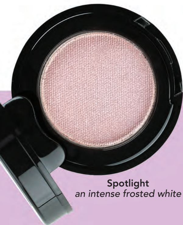
Spotlight an intense frosted white