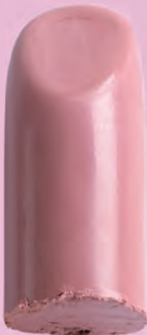
Affair (Luxury Creme) a soft nude pink