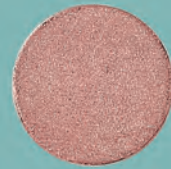
Soufflé a frosted mauve champagne