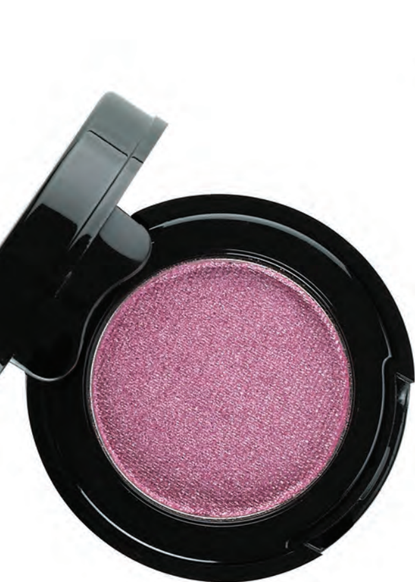
Pinky Up a high-shine hot pink

These shadows are here to shine! Soft, velvety texture glides on in one swipe.