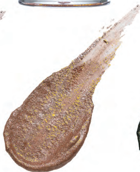
Andromeda a rich brown with silver & gold glitter