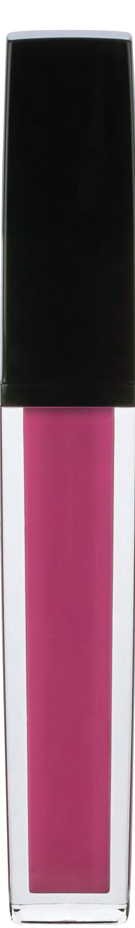
Besos (a bright cool mauve)