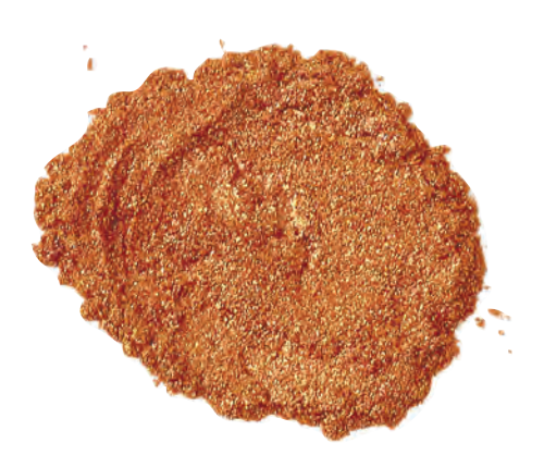
Steampunk (a deep gold with burgundy undertone)