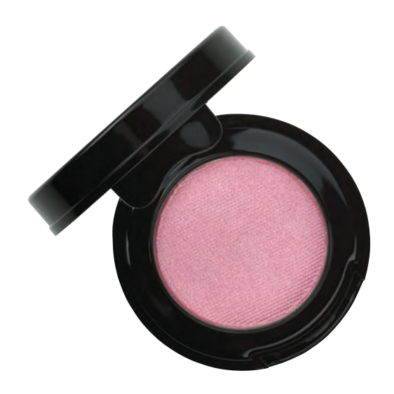
Samba (a cool light pink)

These high pigment shimmery shades deliver an eye-catching satin finish.