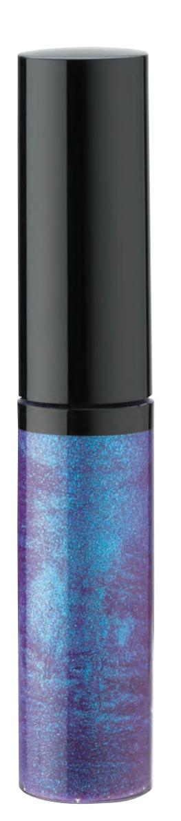
Day Tripper (a semi-sheer purple-blue with iridescent pearls)

Sparkling pearls precisely blended into a velvety lip gloss for an extra luscious burst of shine.