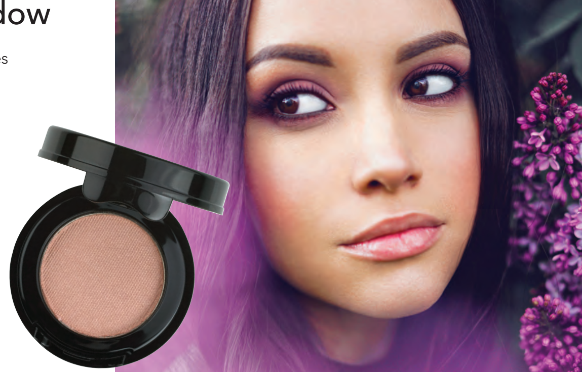
Carefree (a champagne beige)

NEW Shiny Silver Mid-Size Eye Shadow Packaging