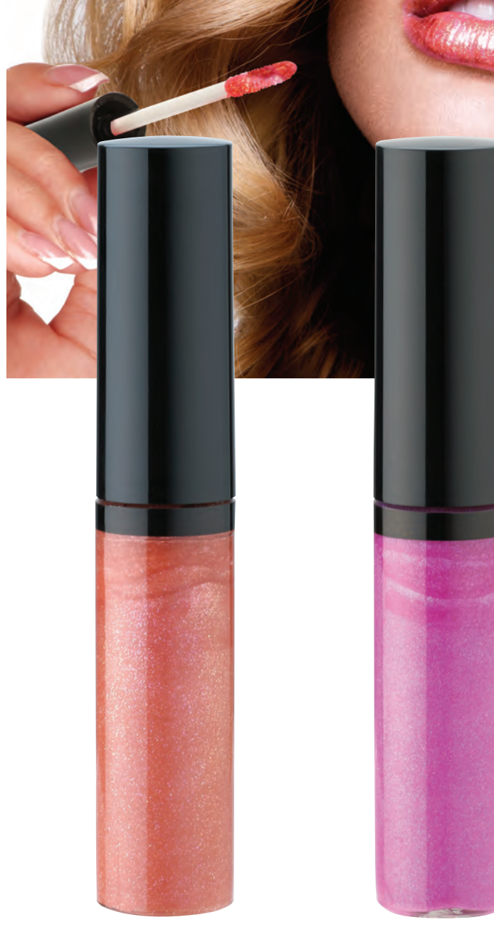
Frose (a sheer peach with pink sparkle)