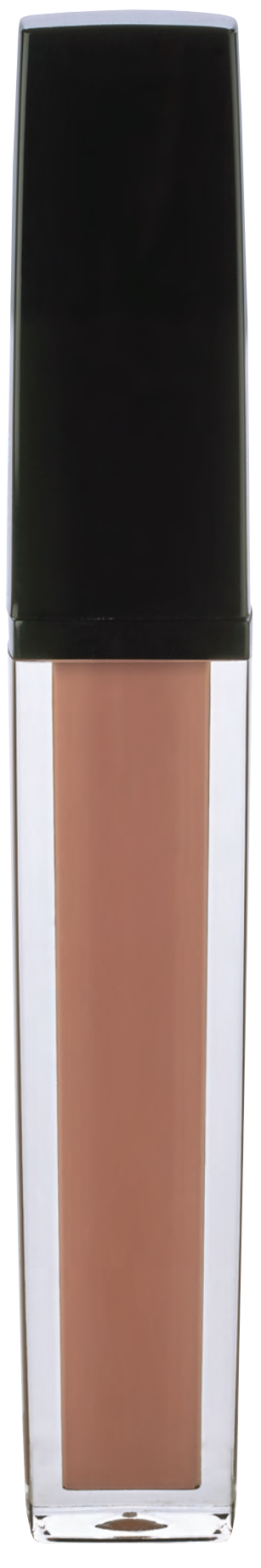
Barista (a toffee nude)

A soft and creamy liquid lipstick that offers highly saturated, full coverage color with a long-lasting plush matte finish.