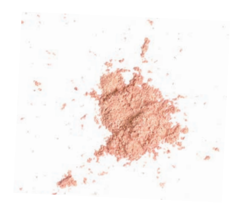
Sunset Kiss (a rose gold)