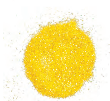
Canary a bright yellow

Dazzling NEW ultra-fine glitters to add the perfect pop of intricate sparkle to your look!