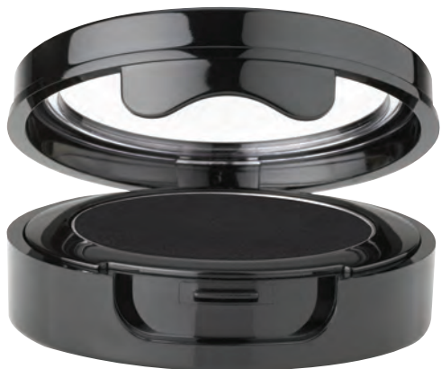
Techno a matte black

Bold, intense, and classic! Black never goes out of style. Also available in drop size.