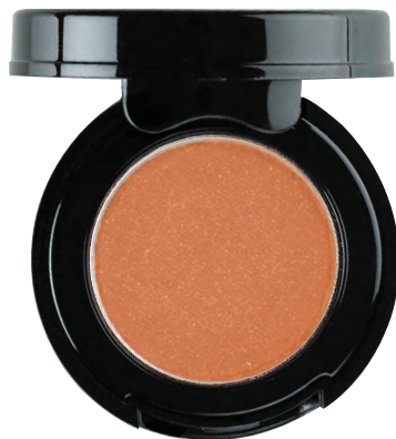
Cowgirl a light terracotta with gold sparkle