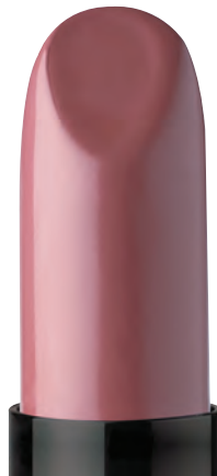
Darling a nude rose