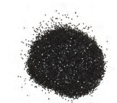
Onyx a matte black