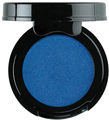
Dynasty a satin sapphire

Stay on trend this season with these captivating versatile hues.