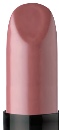
Good Vibes a mauve gray