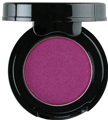
Vice a metallic red violet