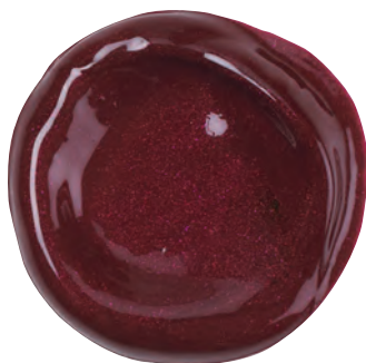
Rebel a deep burgundy red with pink sparkle