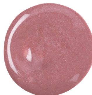
Lola a tan mauve with pink undertone