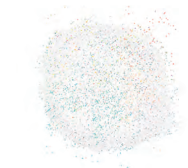
Opal an iridescent white