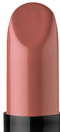
Honeymoon a peachy nude