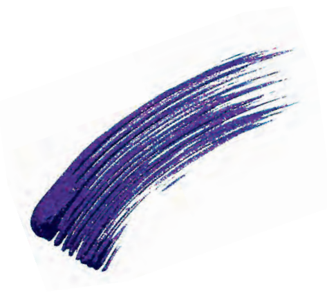
Plum a vibrant purple

A fun new color for our most popular mascara line!