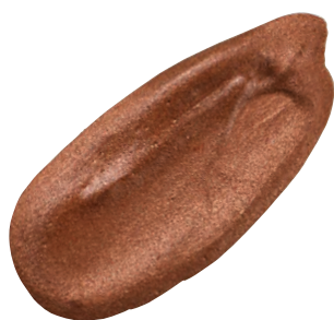
Night Owl a metallic copper brown

Give your lips a trendy dimensional look with this velvety formula.