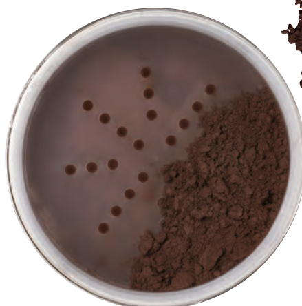
Dark Chocolate a cool deep dark brown