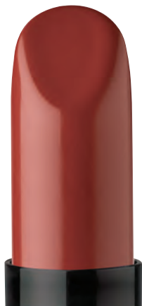
Whiskey a terracotta

A soft, pigment-rich lipstick that's loaded with antioxidants for all day protection and long wear.