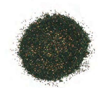
Dragonstone an iridescent black