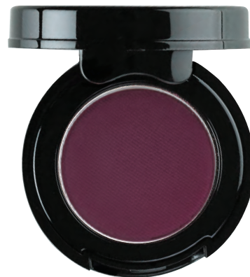
Coven a matte deep eggplant