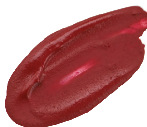
Berry Nice a deep berry rose

Cushion lips for hours in this bold yet sophisticated plush matte color.