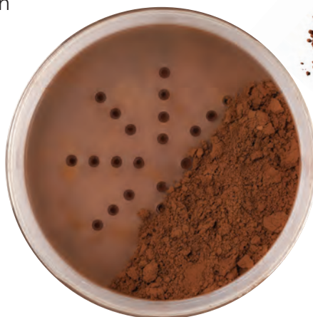
Brown Ochre deep brown with red undertone